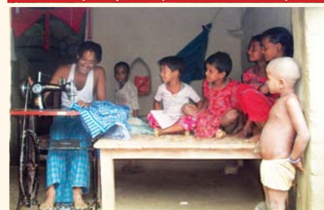
Sewing machine makes this family self sustainable