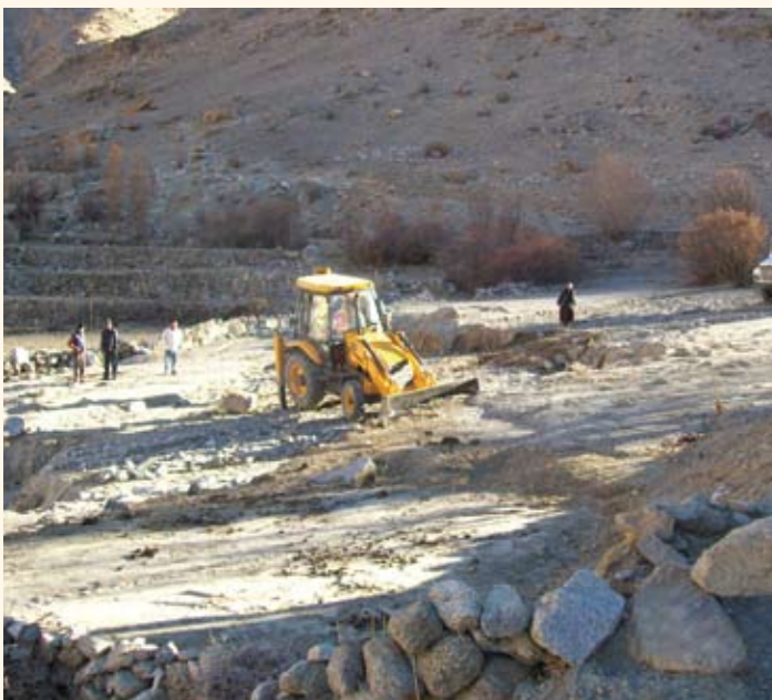
JCB remove debris in a village near Leh