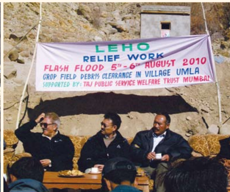
CEC visits an affected village