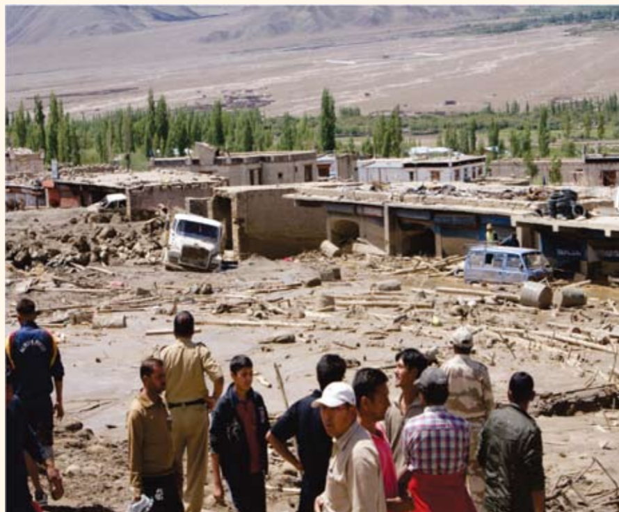
Havoc caused by the cloudburst in Leh

The other disaster which the Trust responded was to support the families affected by the Cloudburst in Leh which occurred in July 2010. The families had already received support in the form of warm clothing, food and medical assistance from other sources. Hence the Trust visited some of the remote areas and assessed the need from the rehabilitation perspective. In consultation with TISS, The Trust partnered with Sir Dorabji Tata Trust and has implemented its program in the following manner: