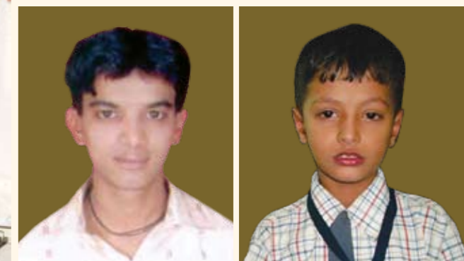
Students supported for education