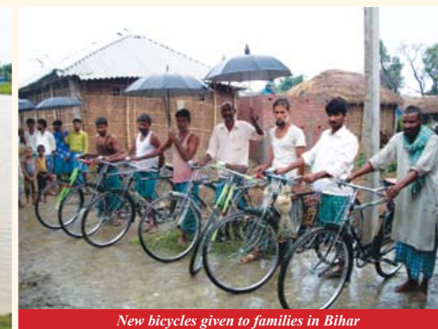
New bicycles given to families in Bihar