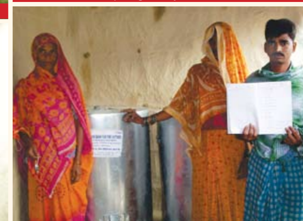
Self Help Group members show their Grain Bank records