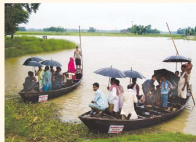
Country boats provided by the Trust makes travel easy